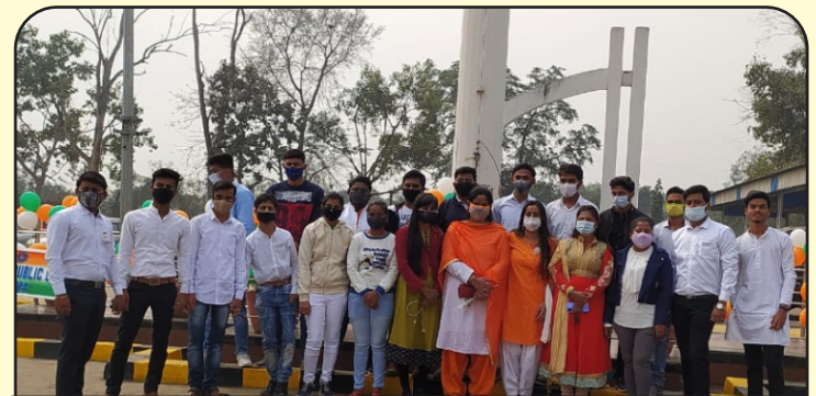
Celebration of "Republic Day" by Rotaract Club