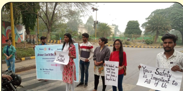
Road Safety Awareness Programme by Rotaract Club