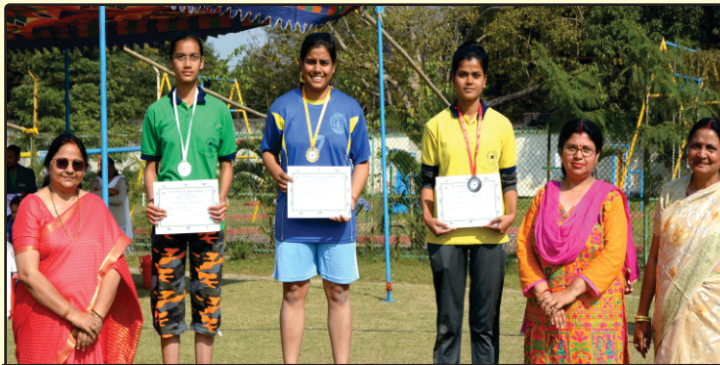
Annual Sports Meet