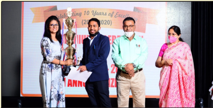
Annual Prize Night