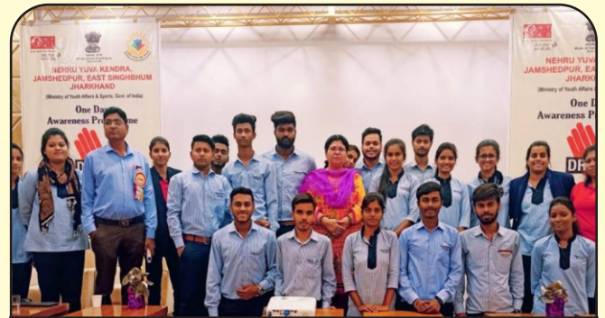
Seminar on "Drug Abuse Prevention & Capacity Building" at SNTI by NSS