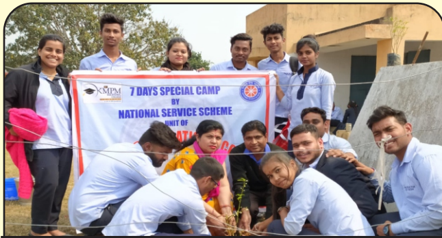
Tree Plantation Programme by NSS