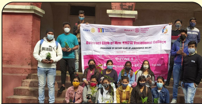
Tree Plantation Programme by Rotaract Club