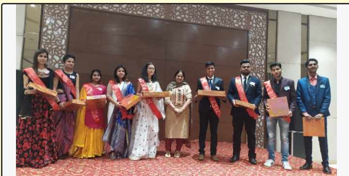
Freshers' Day Celebration