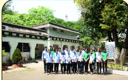
J - ROAD CAMPUS