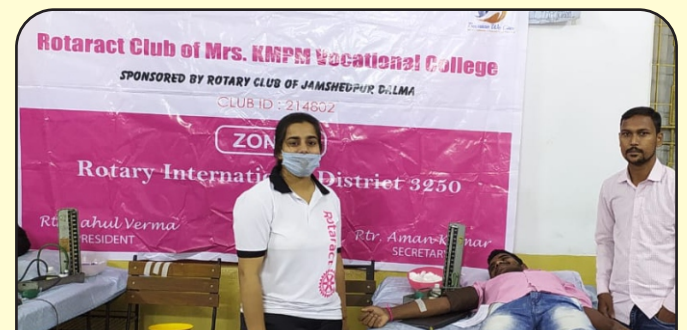
Blood Donation Camp organized by Rotaract Club