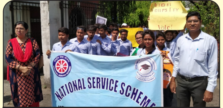
Rally on "National Voters Day" by NSS