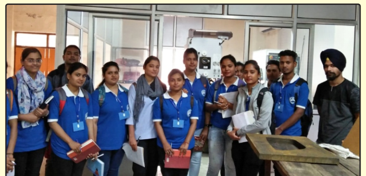
Training Programme at Adityapur Auto Cluster