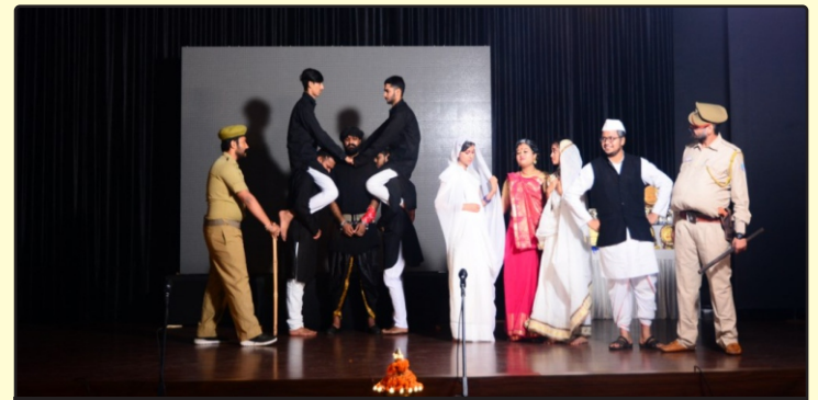
A Play - "Do Koudi Ka Khel"