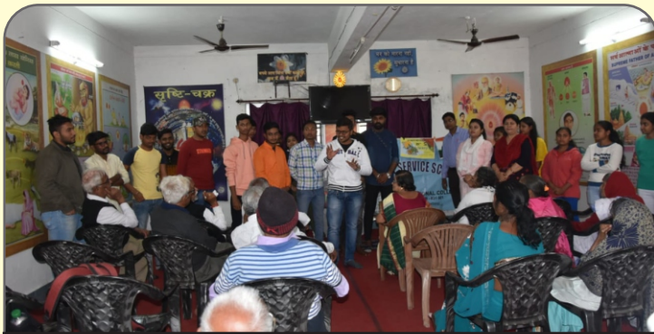
Celebration of "Republic Day" at Old Age Home by NSS