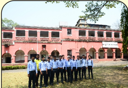
MAIN ROAD CAMPUS

The college has technology enabled spacious classrooms with individual student seating. A state of art computer lab with TFT machines and high capacity server have been set up to provide the best practical training facility for the students. The college offers library facilities both within the premises and outside to ensure students have access to vast reference pool. In addition the college has adequate games and recreation facilities to ensure that students have outlets for both their physical and creative energies.