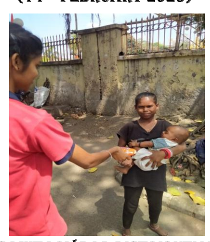
SANITARY PAD DISTRIBUTION (29<sup>TH</sup> APRIL 2023)