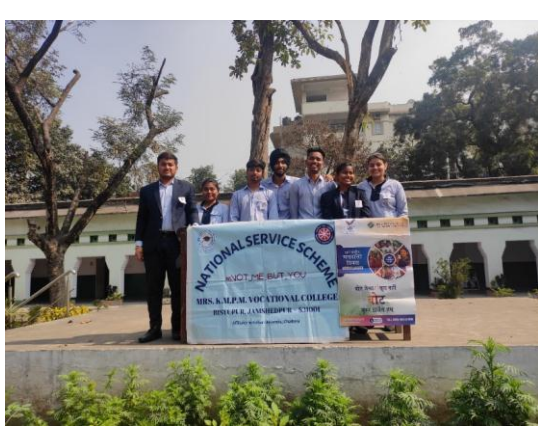
NATIONAL VOTER'S DAY (25<sup>TH</sup> JANUARY 2023)