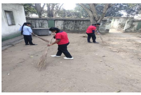
CLEAN CAMPUS DRIVE (5TH JANUARY 2023)