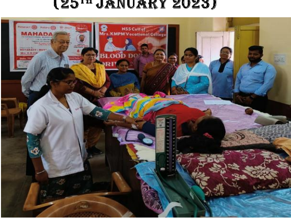
BLOOD DONATION CAMP (16TH MARCH 2023)