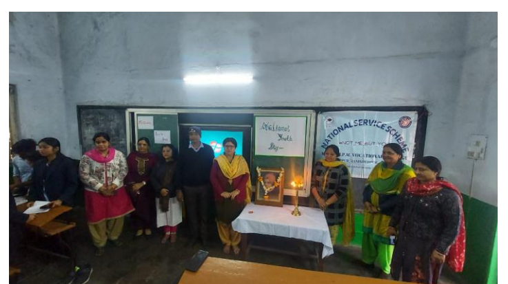
NATIONAL YOUTH DAY (12<sup>TH</sup> JANUARY 2023)