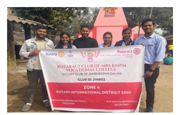
FOOD DONATION DRIVE (2ND JANUARY 2023)