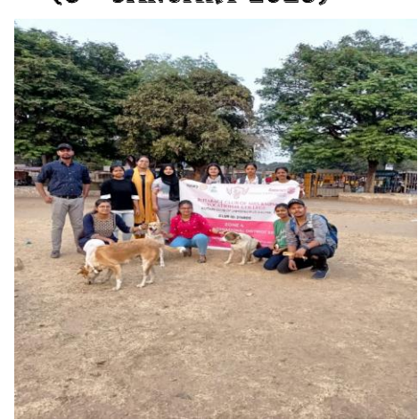
PAW-TIE RADIUM BELT TO STREET DOG (12<sup>TH</sup> MARCH 2023)